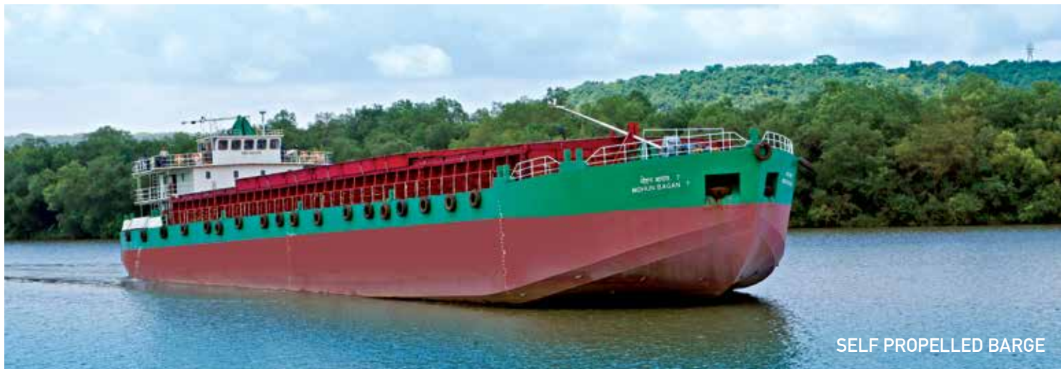
SELF PROPELLED BARGE