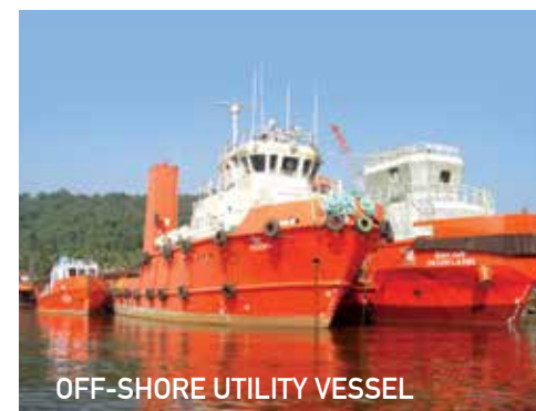
OFF-SHORE UTILITY VESSEL

Over the years, Mandovi Drydocks has diversified its profile by venturing into ship designing and building, as well as conversions, upgradations and modifications of existing boats and ships to enhance their performance capabilities. It has developed a wide range of maritime products for the commercial sector, including fishing trawlers, pontoons, inland cargo barges, passenger vessels, tugs, ferry boats, dredgers, off-shore utility vessels and coasters.