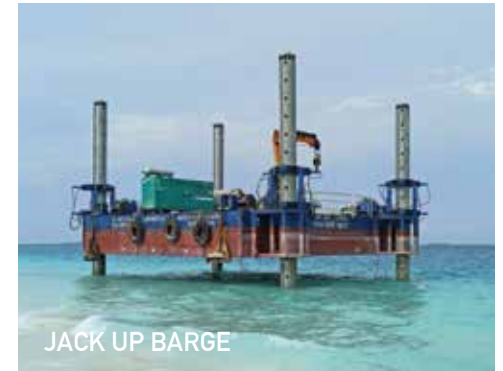
JACK UP BARGE