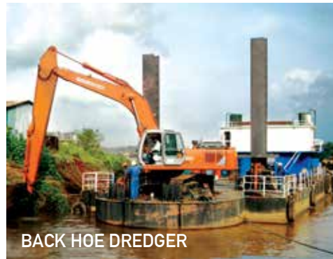
BACK HOE DREDGER