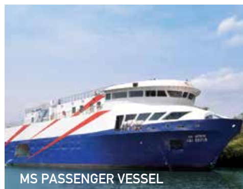
MS PASSENGER VESSEL