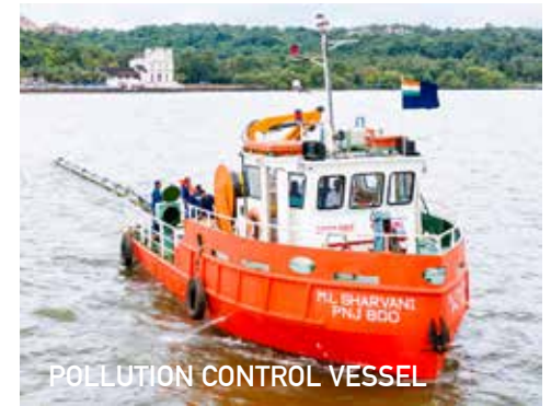
POLLUTION CONTROL VESSEL