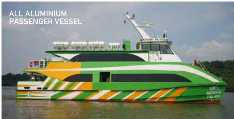
ALL ALUMINIUM PASSENGER VESSEL