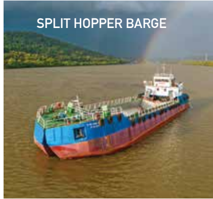
SPLIT HOPPER BARGE